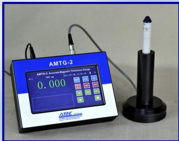
AMTG-2 with probe